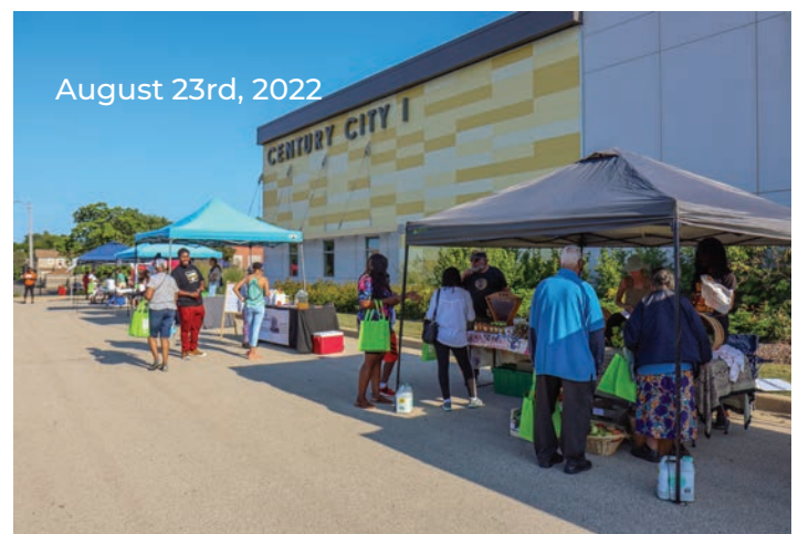
August 23rd, 2022