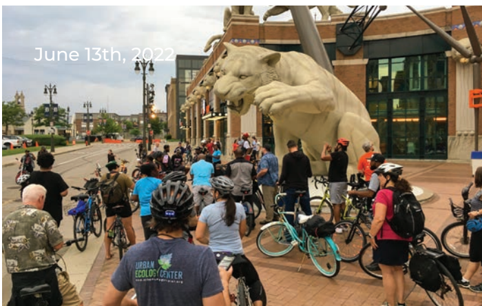
(Above): Biking the Soul Roll Detroit.

NWSCDC staff members had a phenomenal time meeting residents, advocates, and project partners while touring neighborhoods along the Joe Louis Greenway and learning about the trails system in Detroit. We got the chance to join one of the D-Town Riders Bike Club Monday evening Soul Roll Detroit events! NWSCDC is excited to be a part of the work on catalytic trail projects here on the North Side along the 30th Street Corridor railroad tracks. We send a big thank you to Rails-to-Trails Conservancy and the SmithGroup for hosting us!