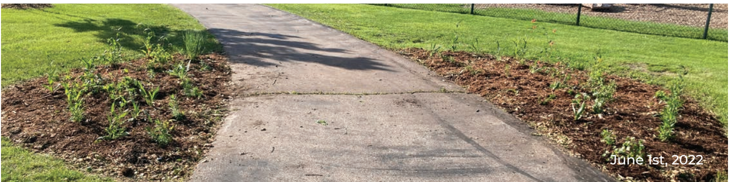
June 1st, 2022