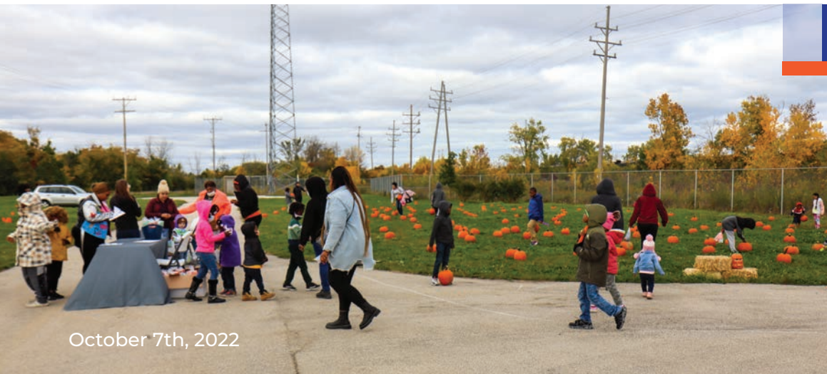
October 7th, 2022