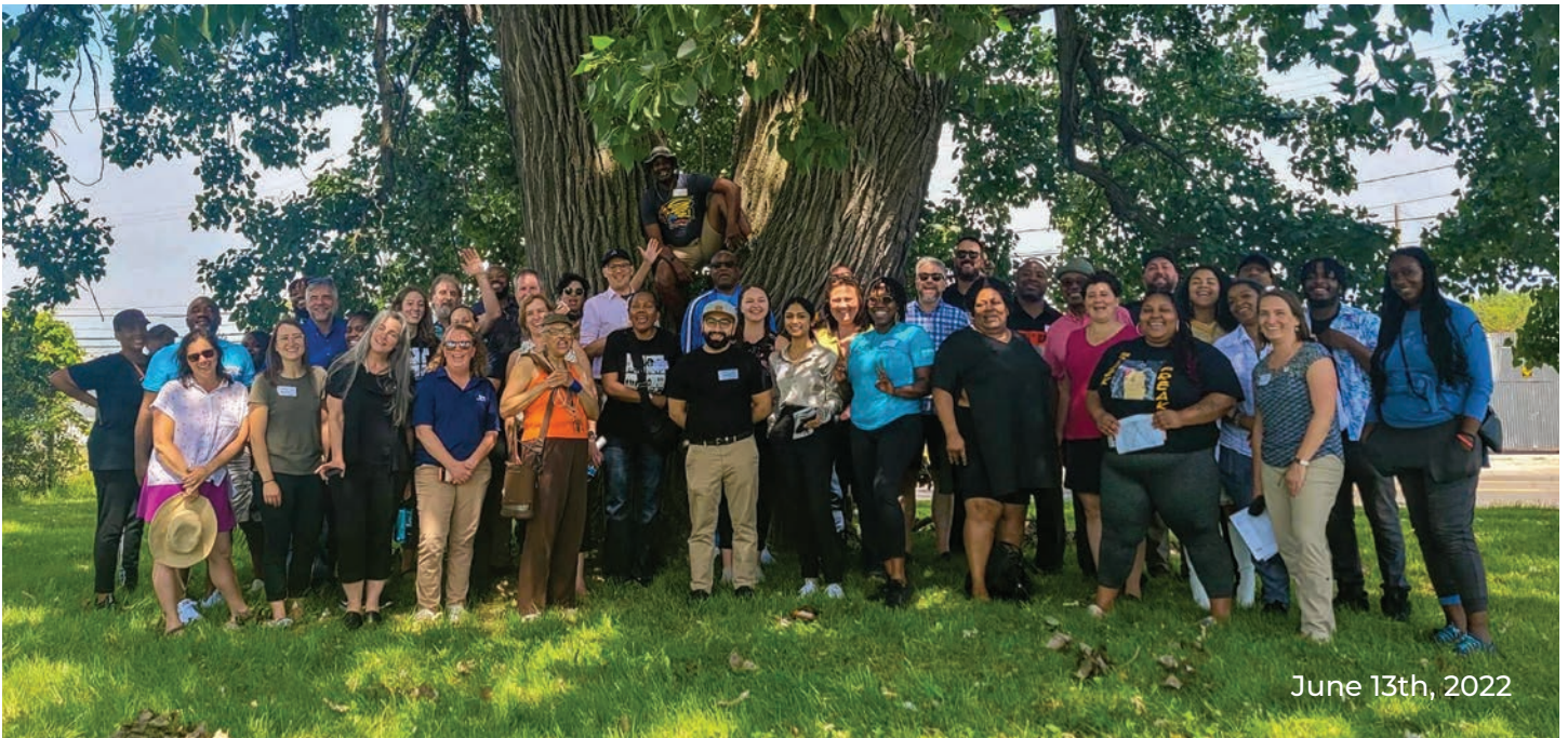
(Above): A group photo taken during a Detroit Neighborhood bus tour.