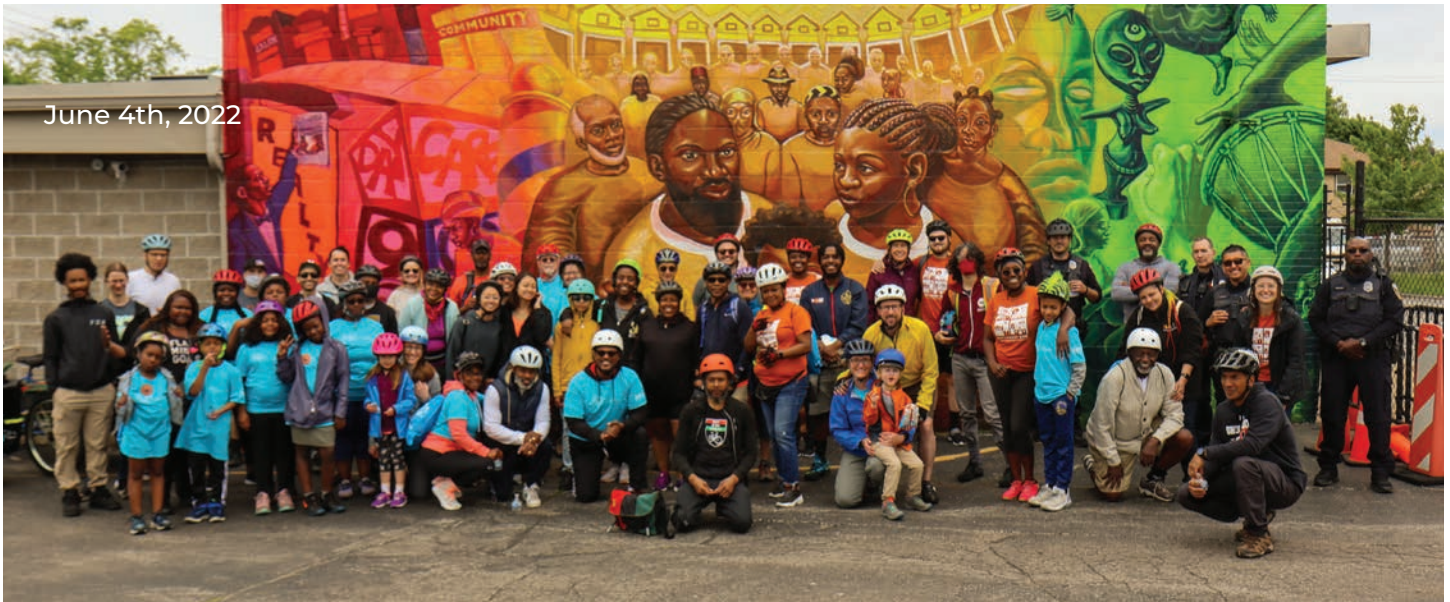
(Above): 2022 Promise Zone Bike Ride group photo in the Old North Milwaukee Neighborhood.