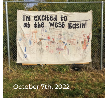
October 7th, 2022

On October 7th, NWSCDC hosted a Free Pumpkin Friday event at the MMSD West Basin. A total of 150 pumpkins were scattered throughout to create a pumpkin patch at the site, where families could choose their favorite to take home. Residents had the opportunity to discuss the West Basin Project with MMSD who was tabling at the event. A large canvas was displayed for neighbors to draw on, with the prompt: "I'm excited to ____ at the West Basin." Participants left the event with a goodie bag filled with treats, fall recipes and pumpkin carving ideas.