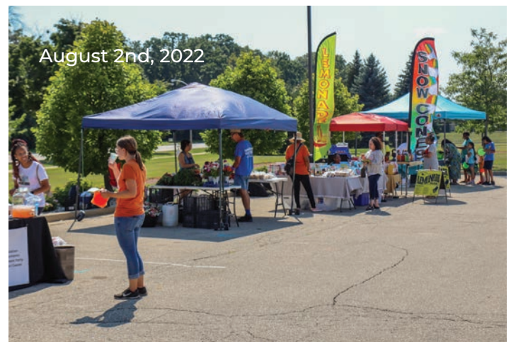
August 2nd, 2022

NWSCDC hosted the 3rd Annual North Side Pop-up Farmers Market on Tuesdays in August. Five markets throughout the month took place at three North Side locations including: Ascension All Saints Family Health Center, Century City Business Park and the MMSD West Basin. Products at this year's markets included: fresh produce, honey, salsa, fresh pressed juices, lemonade and coffee beverages, Popsicles, popcorn, t-shirts, poems, children's books, kombucha, bakery and desserts, plants, handmade soaps and candles, and flower bouquets. MKE Elevate, a part of the City of Milwaukee Health Department, tabled every Tuesday to support the promotion of healthy foods and lifestyles in unison with the mission of the North Side Pop-up Farmers Market.