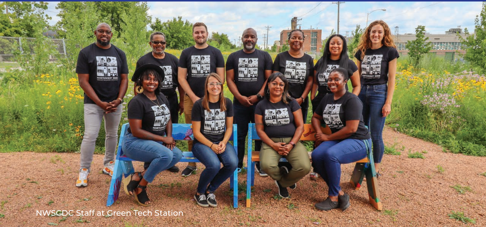
NWSCDC Staff at Green Tech Station