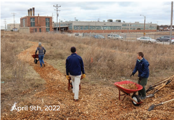
(Above): New wood chips are placed for walking paths at GTS. (Below): StormGUARDen installation.