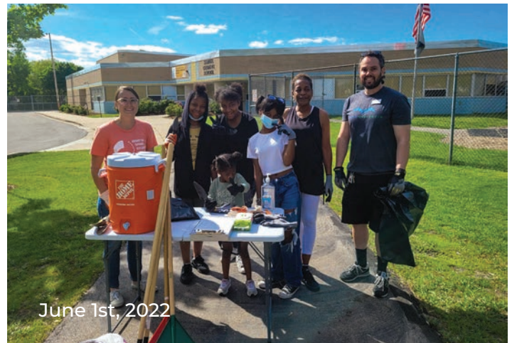
June 1st, 2022

On June 1st, NWSCDC partnered with Clean Wisconsin to provide a rain garden demonstration and maintenance activity at Samuel Clemens Elementary School. Participants had the opportunity to learn about native plants and stormwater management practices.